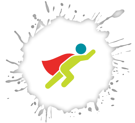
BUILD THEIR CONFIDENCE

These programs encourage fun and friendship, creativity and collaboration, growth and development . Discover our entire collection of enrichment programs.