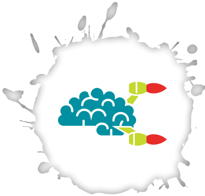
EXPAND THEIR MINDS

WE OFFER SEVERAL EXTRACURRICULAR OPPORTUNITIES, FOR AN ADDITIONAL FEE, THAT WILL INTRODUCE YOUR CHILD TO EXPERIENCES BEYOND THEIR DAILY CLASSROOM CURRICULUM. THEY'LL DISCOVER UNIQUE OPPORTUNITIES IN VARIOUS SUBJECTS THAT ARE DESIGNED TO: